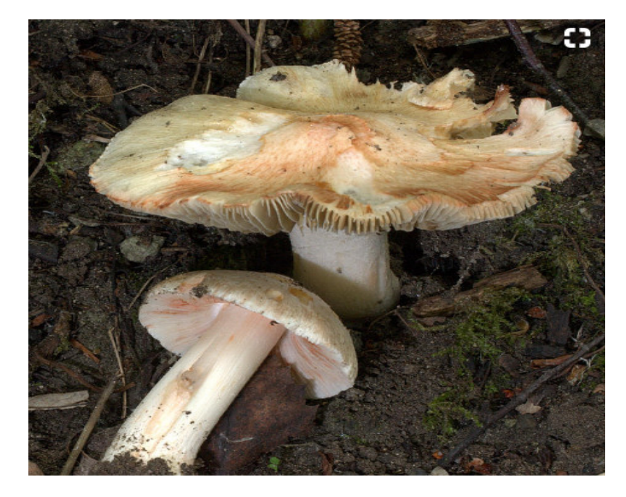
Figure 2. Inocybe erubescens, the most common Inocybe species associated with toxicity in Europe.

The latency to first signs of poisoning varies between 15 min and 2 h after consumption. Clinical manifestations include nausea, vomiting, abdominal pain, diarrhea, hypersalivation, diaphoresis, hypotension, tearing, blurred vision, miosis, tremors, restlessness, flushing and syncope. Additionally, this sickness has a good prognosis after supportive treatment, including intravenous fluids, antiemetics and 1 mg atropine intravenously. Full recovery is usually within 12 h [16].