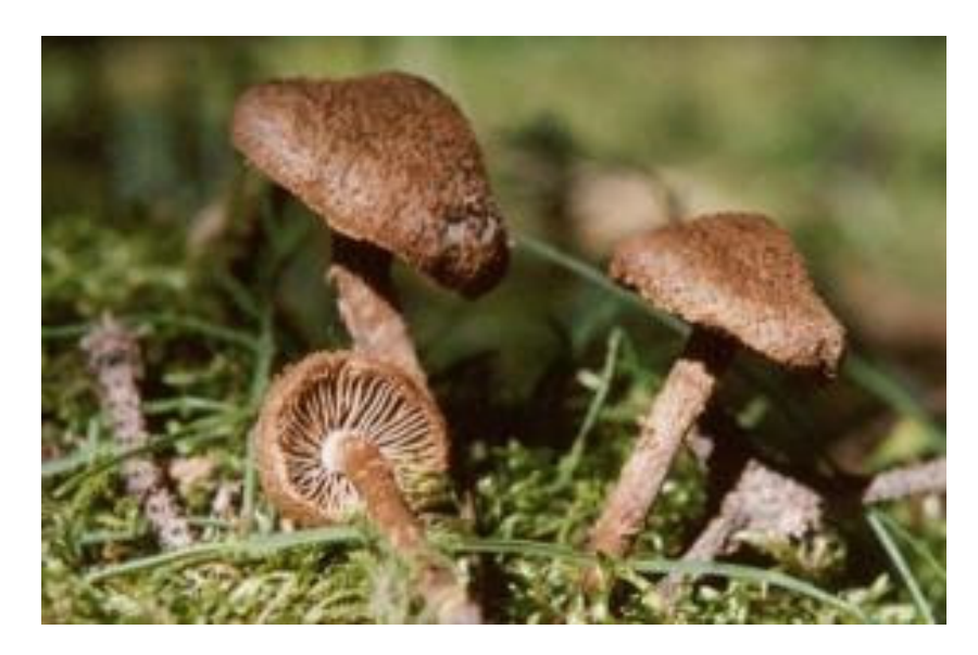
Figure 1. Inocybe mushrooms.